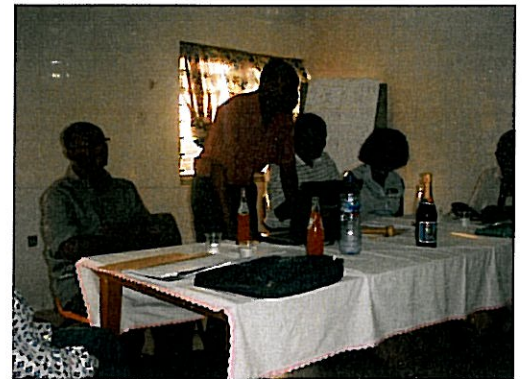
New Rotary Club chartered in Apam on 3/10/12 with 36 charter members!