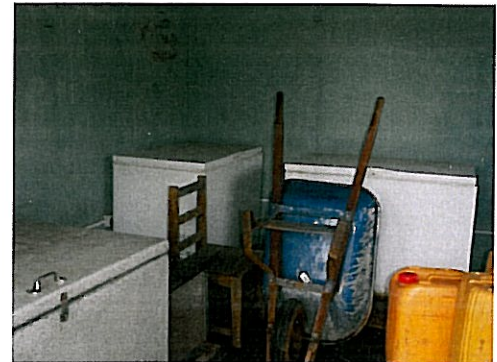
Current freezer set-up in Apam for making ice; minimal impact on fishing industry

The Project: Building Solid Foundations has been working in Apam, Ghana for the past eight years to help bring clean water, improved waste-water processing, educational resources, medical equipment and supplies, and community development programs to this rural fishing village on the coast of Ghana. Over the years, members from various Rotary Clubs in District 7390 have participated in humanitarian trips and sent over equipment and supplies purchased by Rotary members and fundraising programs. This coming year various Rotary Clubs in District 7390 are partnering to submit a larger district simplified grant to support the purchase of refrigeration and freezer equipment for the newly constructed fish processing factory in Apam. Won't you consider joining us in this project? Your commitment: raise $1,500 in your club for the project; that will be matched 1:1 by the district. Also, you must send a representative from your club to a District Simplified Grant information session on April 21 at the District Assembly. ( *If your club cannot commit to the full $1,500 amount, there are funds available to supplement what your club can raise to result in the full $1,500. ) Members of the Downtown York and West York Rotary Clubs will write and submit the actual grant. This is a great way for your club to be involved in an international project! Also, this is a great project to help our district gear up for Rotary's new Future Vision Plan.